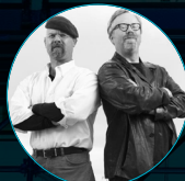
ADAM SAVAGE & JAMIE HYNEMAN